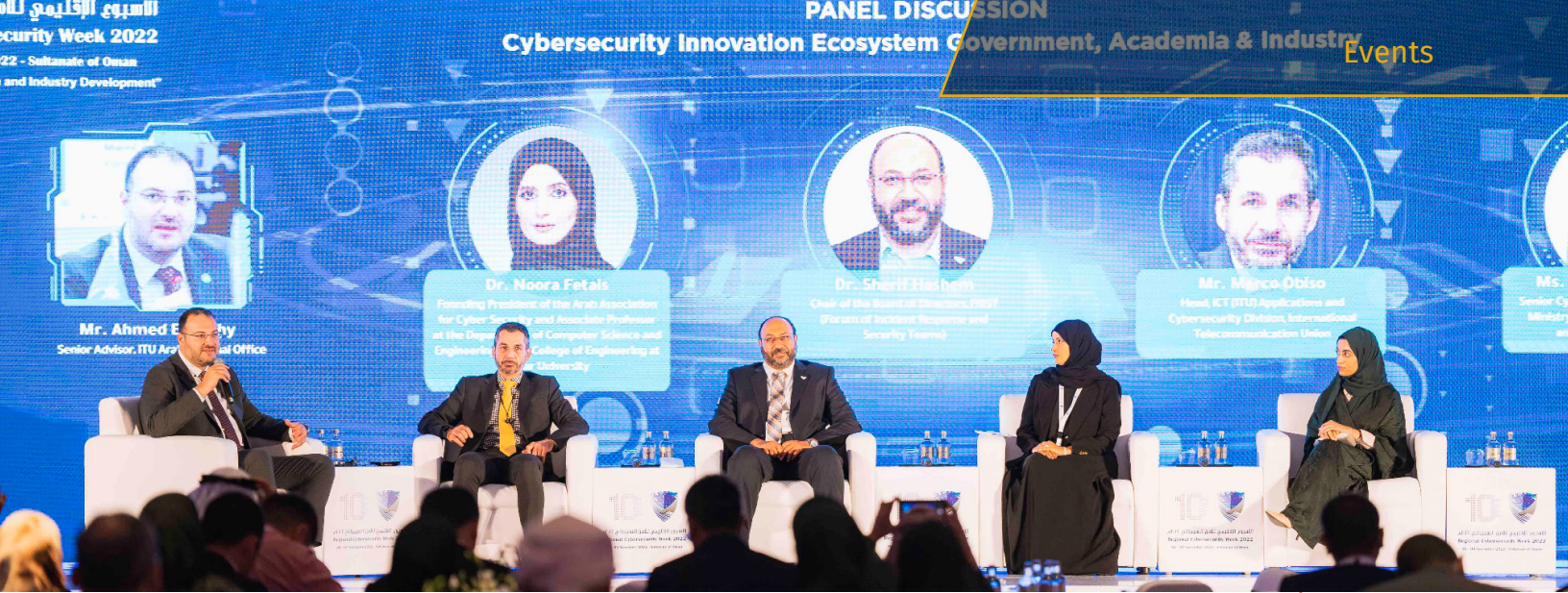
Regional cybersecurity Summit and FIRST & ITU-ARCC Regional Symposium for Africa and Arab Regions