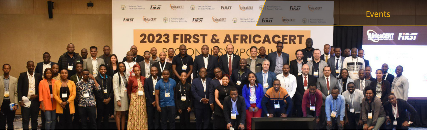
2023 Regional Symposium – Africa *Largest Africa Regional (in-person) to Date*